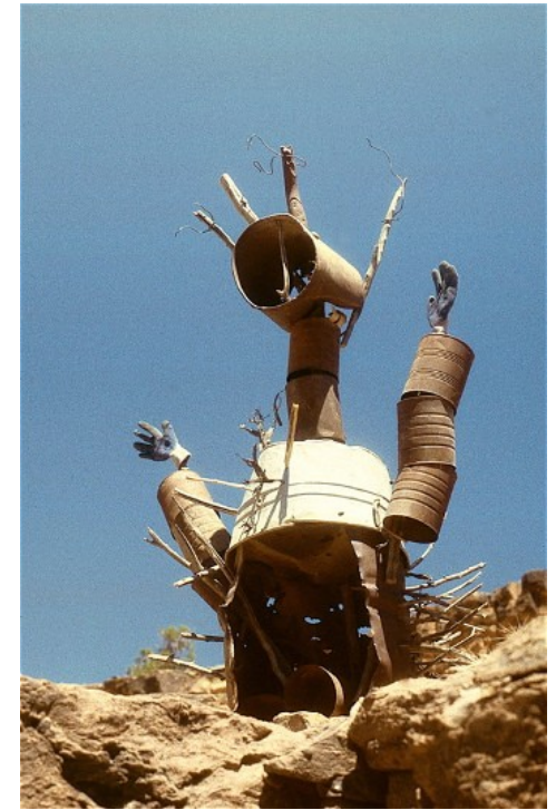
Porcupine Totem Coalbank Canyon/ Colorado, USA

This kind of art provides a very gentle and poetic way to gain a short term influence over that place.