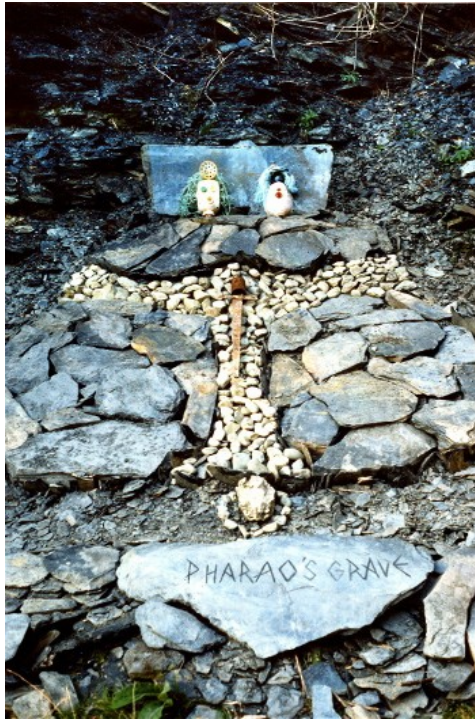
Pharao's Grave (Detail) Timaleague/ Ireland