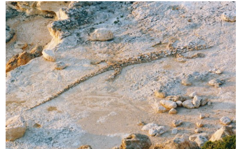
El Largato Ibiza/ Spain