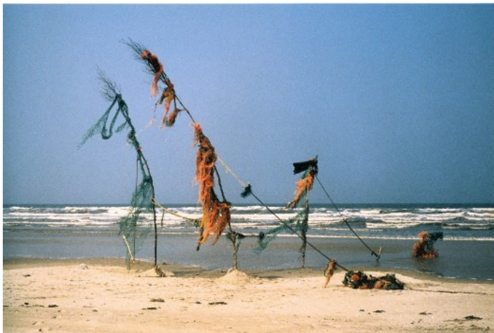
Piratenschiff Norderney/ Germany