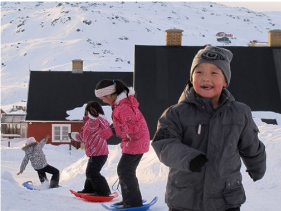
Kids in Greenland