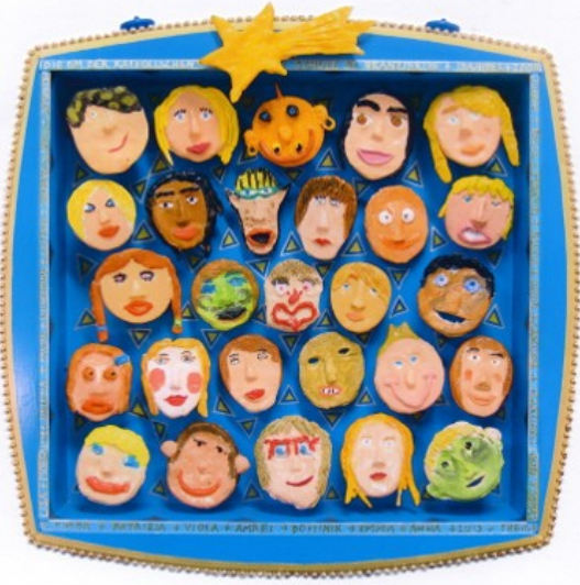
6 Classes/ 6 Pictures 6 th Class, Selfportraits